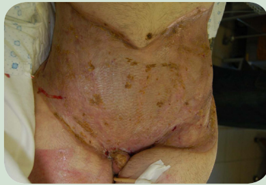
Figure 3: The same patient as shown in Figure 2, two months post coverage with split thickness skin grafts.

split-thickness skin grafts [9] [Fig 3]. This can be performed in the hospital or the patient can be discharged to a rehabilitation centre until their nutrition is sufficient for the wounds to heal.